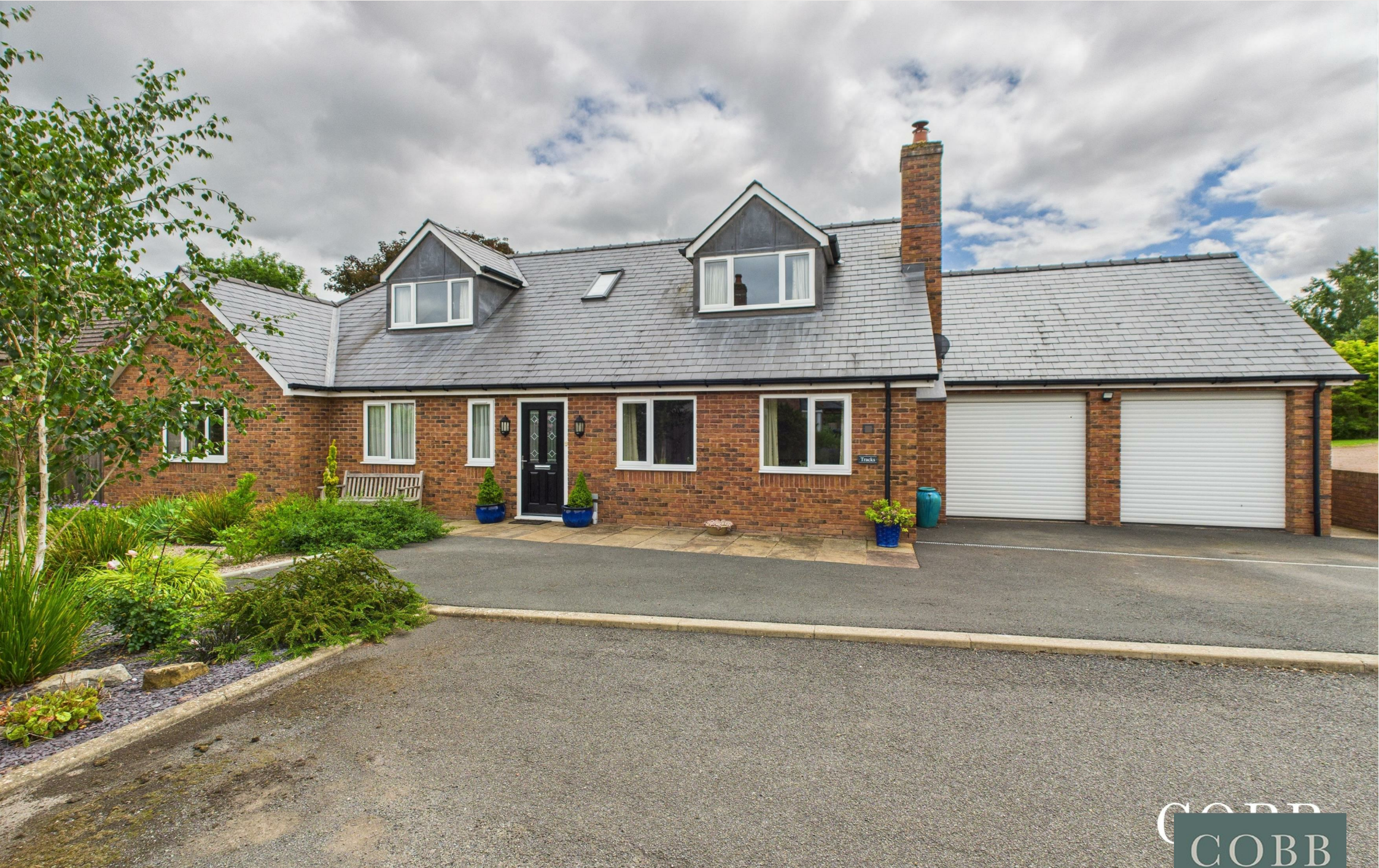
20, Paradise Meadows, Marden, HR1 3FA Auction Guide £450,000